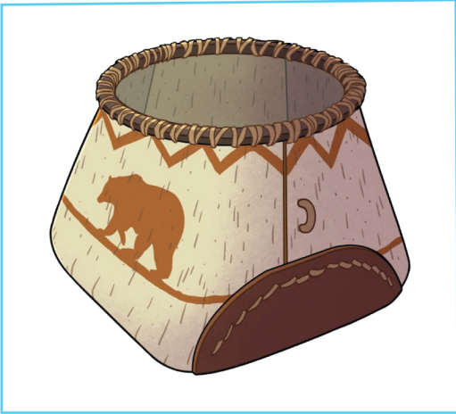
BIRCH BARK BASKET